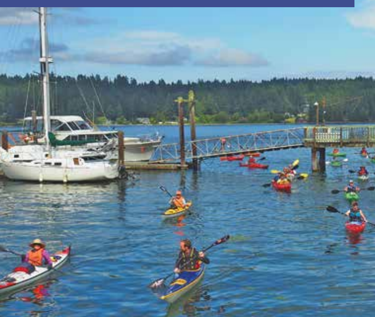
The Natural Side of Puget Sound™