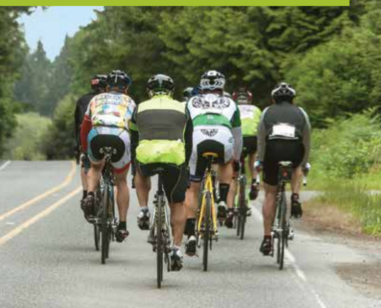
The Natural Side of Puget Sound™